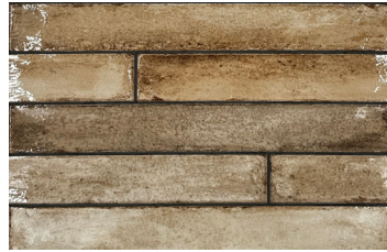
Tierra Brown 2" x 16" x 5/16" IFS2X16HTB