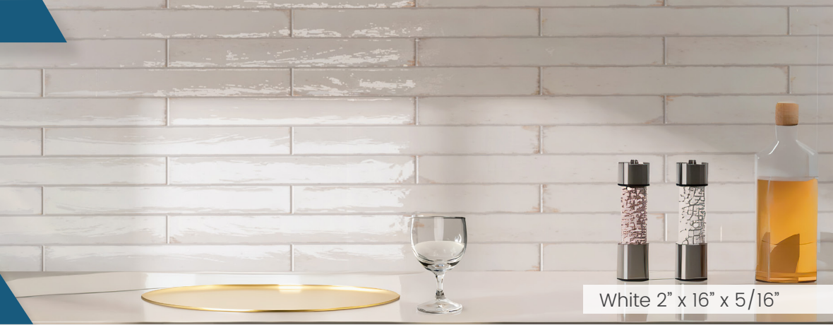
White 2" x 16" x 5/16"