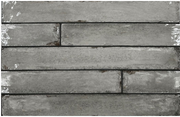
Gray 2" x 16" x 5/16" IFS2X16HG