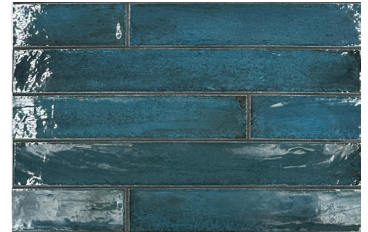
Deep Blue 2" x 16" x 5/16" IFS2X16HDB