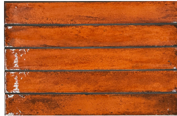
Mission Red 2" x 16" x 5/16" IFS2X16HMR