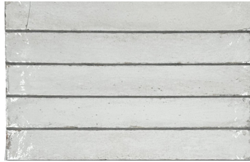
White 2" x 16" x 5/16" IFS2X16HW