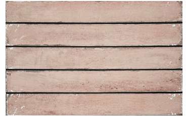
Cerda Rosa 2" x 16" x 5/16" IFS2X16HCR