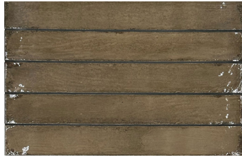
Loden Green 2" x 16" x 5/16" IFS2X16HLG